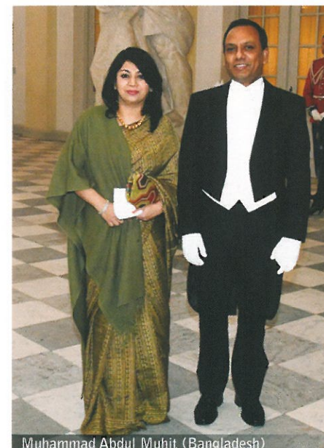
Muhammad Abdul Muhit (Bangladesh)