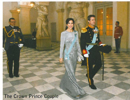
The Crown Prince Couple

While there are concerns about what effect it might have on travel, there is also speculation that a Hard Brexit might generate too much paperwork, encouraging some countries to set up an embassy in London to exclusively deal with British matters, thus moving their northern Europe ambassadors elsewhere.